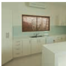
View the quality of our work first hand at our Port Moresby showroom.