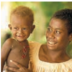
The Anitua Group is supporting a plan to eliminate Malaria from the Lihir Islands.