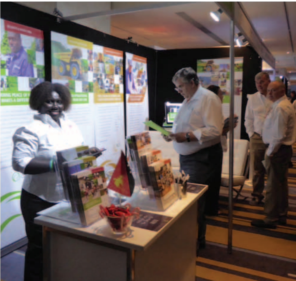
The Anitua, NCS and TAG booth at the 2014 PNG Chamber of Mines conference in Sydney.