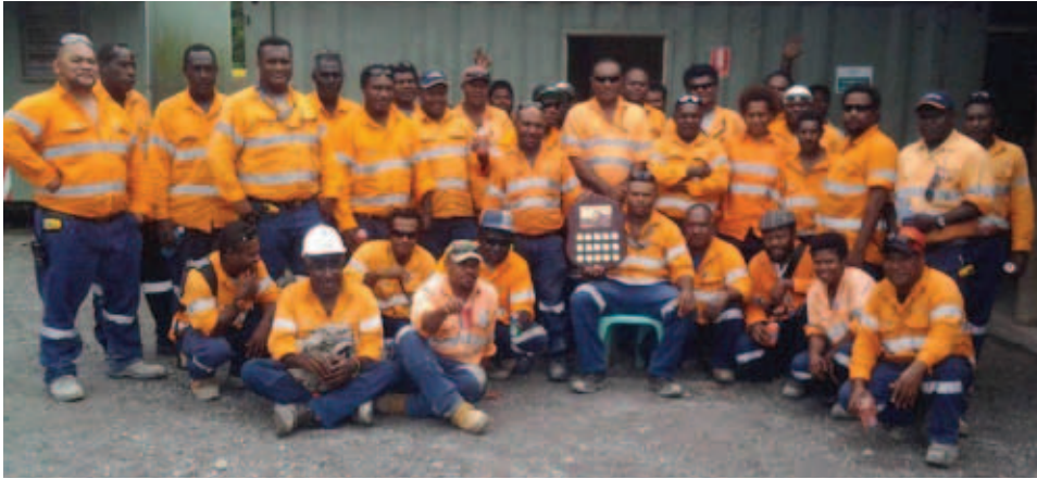
The winning crew with their quarterly safety awards plaque. Congratulations!