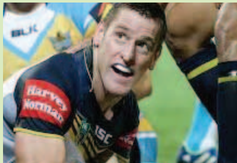
Townsville Cowboys' legend Brent Tate will be in Moresby to promote Anitua Hardware and their range of Luxury Paints.