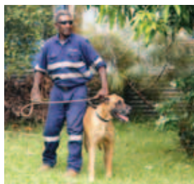
One of Anitua's guard dogs which protect client assets in Namatanai.

Scope Global contract was the considerable work that Anitua has been doing to address gender violence both at work and in the broader community. Closer to Lihir, APS has also secured its first contracts in Namatanai with several static guard and guard dog services.