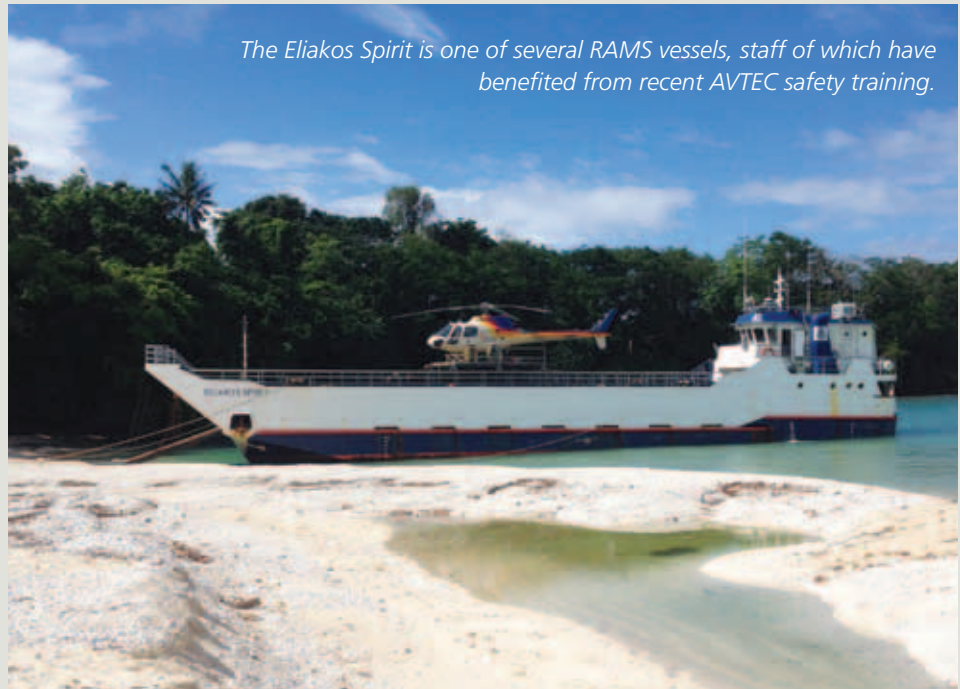
The Eliakos Spirit is one of several RAMS vessels, staff of which have benefited from recent AVTEC safety training.