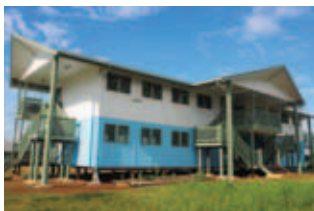
Two storey double classroom at Lihir Secondary School.

Anitua Constructions have been 'living' the Anitua motto of 'Diverse Services – Delivered Solutions' with the completion of numerous projects of many kinds scattered throughout the country. Many of these projects have been in Port Moresby where staff numbers have increased substantially from 30 to 130 in just one year. Just some of the projects completed by Anitua Constructions in 2015 include: